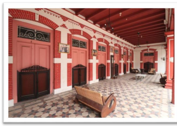
Gambar 1. Kampung Kemas Gresik